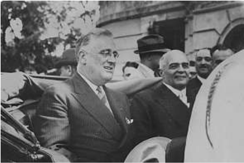
President Roosevelt meets in 1936 with Uruguay's President Terra following the Inter-American Conference for the Maintenance of Peace.