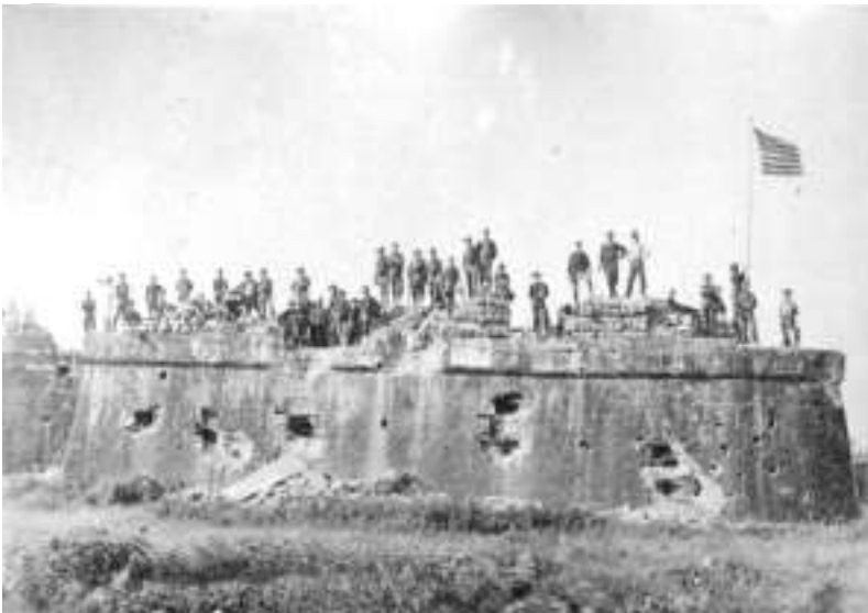
Fort San Antone de Abad in Cuba after U.S. bombardment in 1898.