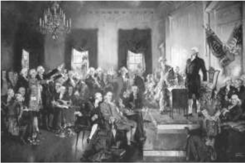
The Constitutional Convention of 1787.

Just months before his death, President Roosevelt noted that the United States had learned “that we cannot live alone, at peace; that our own well-being is dependent on the well-being of other nations—far away. We have learned to be citizens of the world, members of the human community. We have learned the simple truth of [Ralph Waldo] Emerson that ‘the only way to have a friend is to be one.’” This ethos formed the cornerstone of his vision of international engagement and U.S. foreign policy.