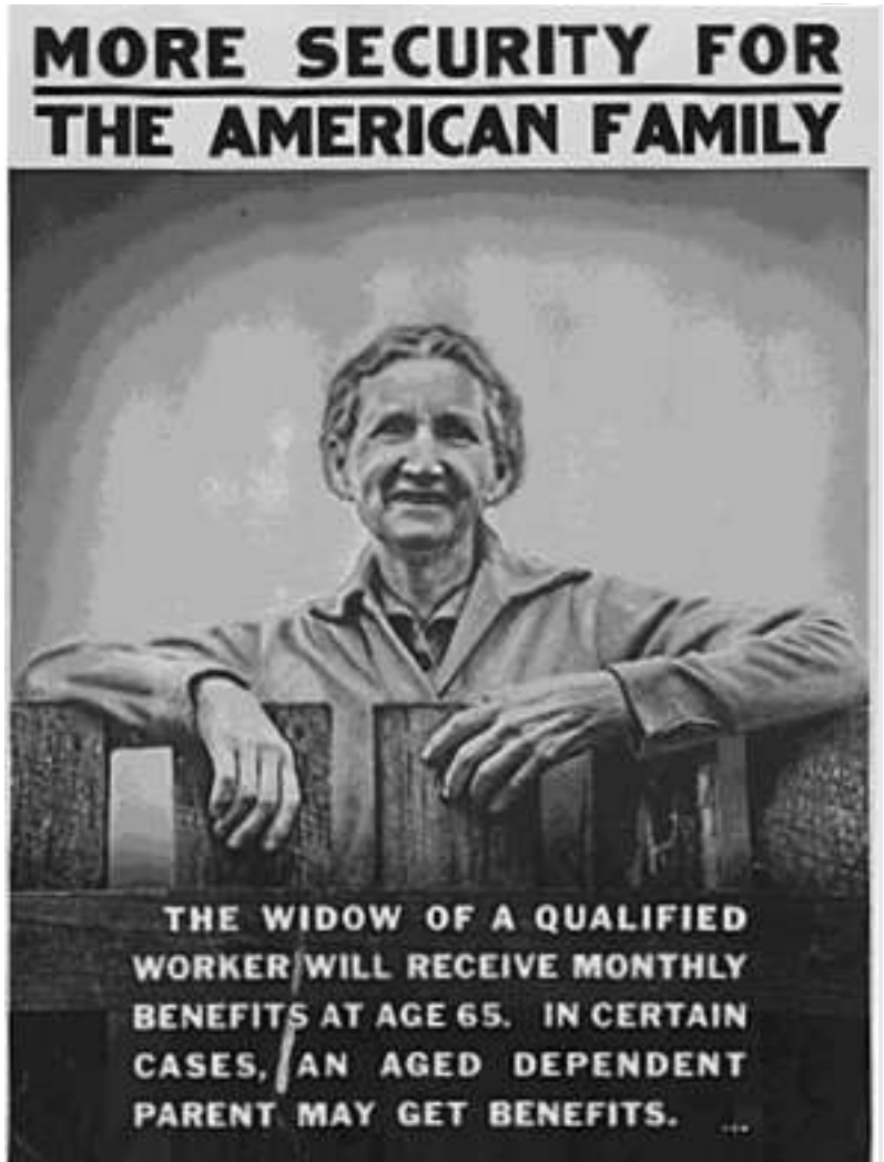
Government poster in 1930s promoting Social Security programs.

Deep tax cuts benefiting the wealthy, massive increases in military spending, and mounting health care costs have been the major contributing factors to the fiscal