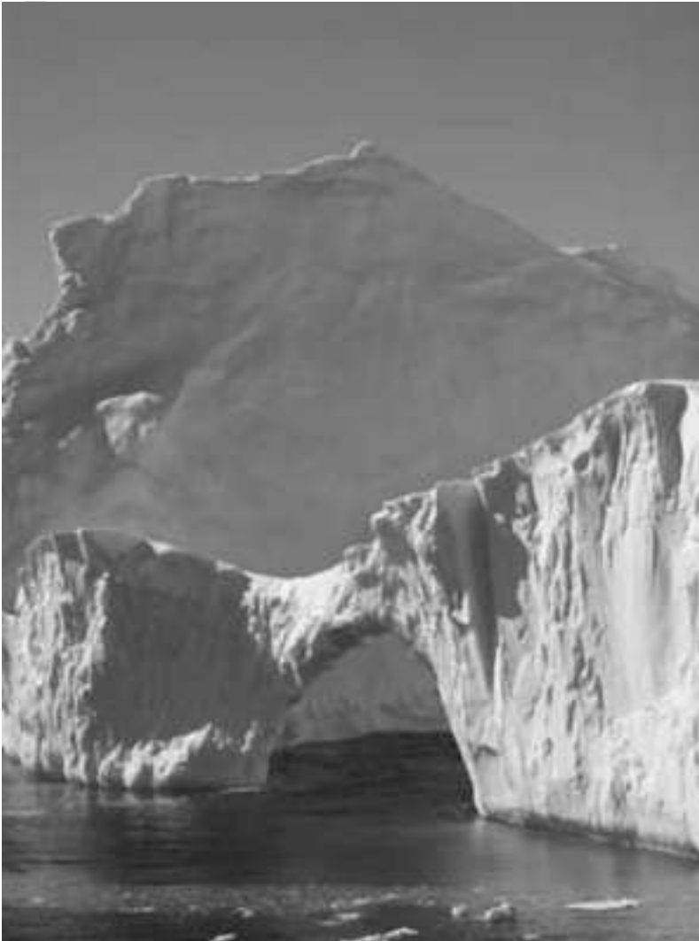
Melting polar cap glacier.

replaced by institutions with a clearer mandate and commitment.