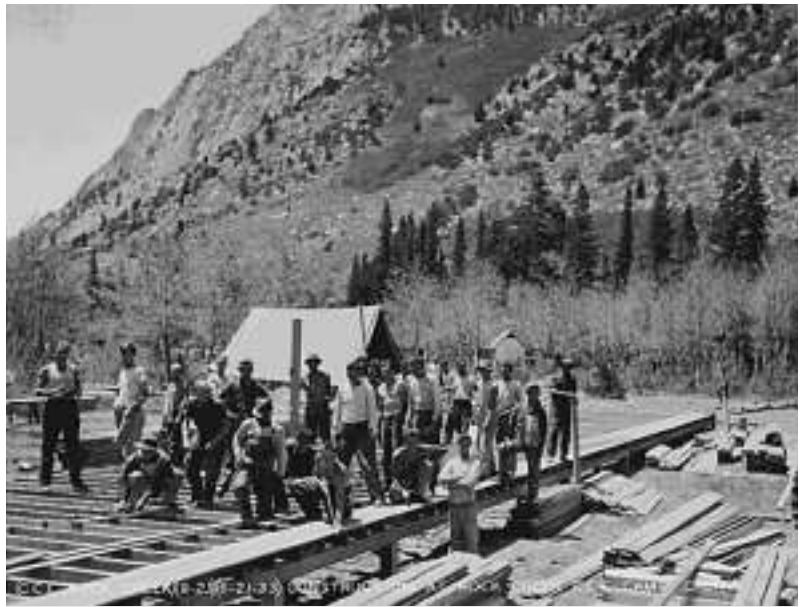
Civilian Conservation Corps public works project in 1933.

Washington's bilateral trade and aid agreements have repeatedly placed U.S. economic and political interests