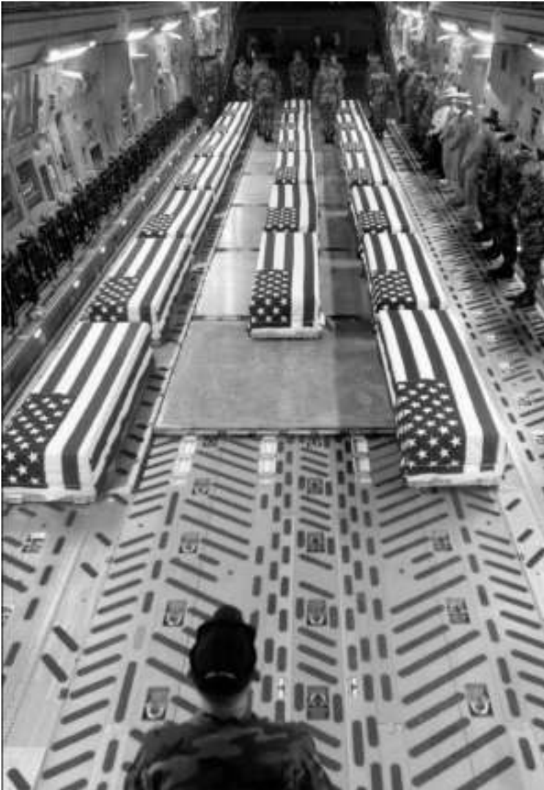
U.S. soldiers being returned from Iraq at Dover Air Force Base.

In the name of national security and confronting threats to “our national interests,” this doctrine committed the nation to an expanded foreign and military policy that engulfed problems of “poverty, weak institutions, and corruption” in states viewed as threatening or unstable around the globe. This “global cop” role defines U.S. national security so broadly that it requires an armed presence in nearly all corners of the world.