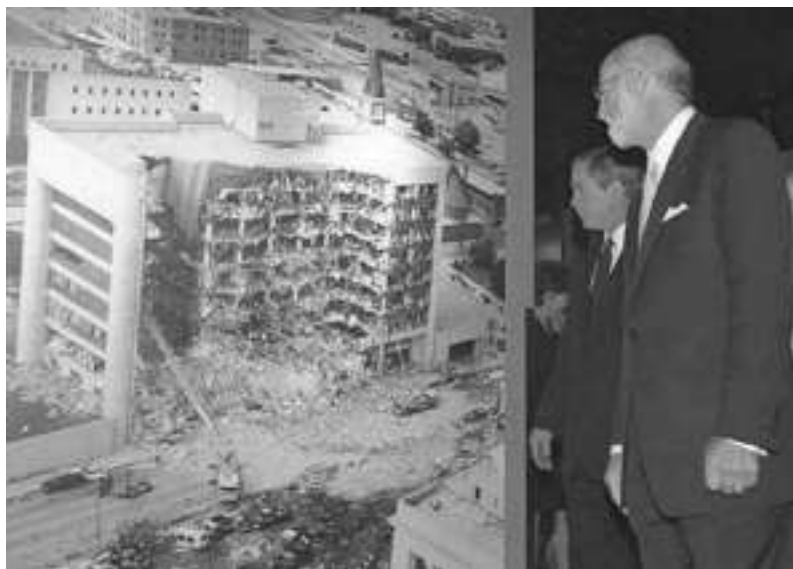
President Bush looks at a photo of the Oklahoma City Murrah Federal Building bombing at the Oklahoma City National Memorial Feb. 19, 2001.

After September 11, 2001, the Bush administration announced a new national security doctrine that broadened the definition of U.S. security further still. “As a matter of common sense and self-defense, America will act against such emerging threats before they are fully formed,” declared Bush in his September 2002 National Security Strategy document. Thus preemptive strikes became the watchword of the modern military game plan.