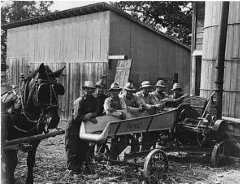
Farm cooperative supported by the New Deal.

businesses and say little about the rights of people to a decent workplace and a healthy environment.