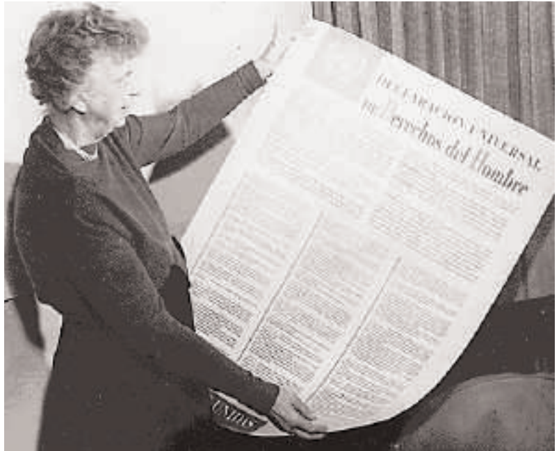
Eleanor Roosevelt displays the UN Universal Declaration of Human Rights in Spanish in 1949.

The United States should be a leader in this regard. Instead it lags behind many other countries in its sup-