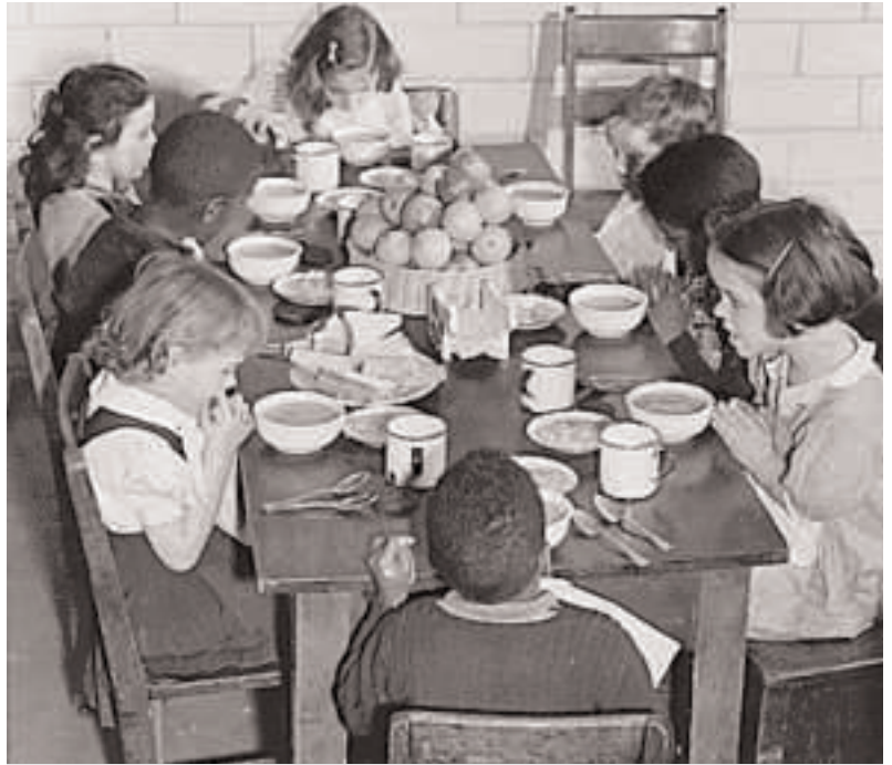
Government school lunch program launched as part of New Deal.

Ending bad neighbor practices would create greater fiscal responsibility in government. At a time of record deficits, the country needs to halt the enormous drain of U.S. financial and human resources into wars, military occupations, and programs to militarize other countries.