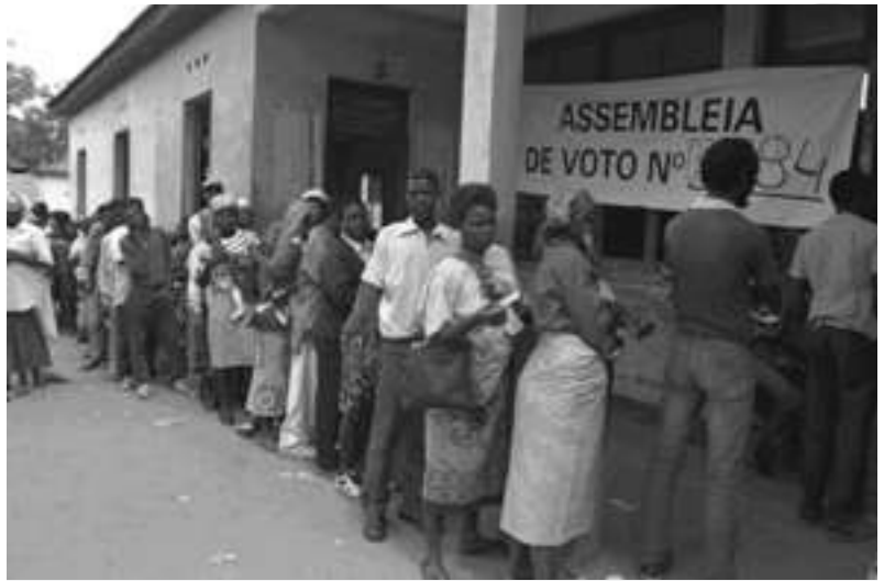
UN-assisted elections in Mozambique, in 1994.

Eleanor Roosevelt, proponent of the Universal Declaration of Human Rights, emphasized that human rights begin “... in small places, close to home—so close and so small that they cannot be seen on any maps of the world. Yet they are the world of the individual person; the neighborhood he lives in; the school or