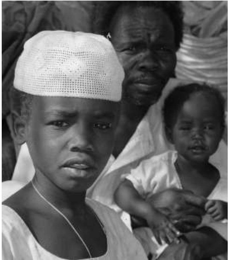
Darfurian family in a Sudanese refugee camp.

In Roosevelt’s day, when leaders spoke in terms of “international community” and global interdependence, they were referring mostly to trade relations and military concerns. Today, however, any reflection on global interdependence invariably leads to consideration of an array of transnational challenges that weren’t part of the conventional foreign policy discourse of the mid-20th