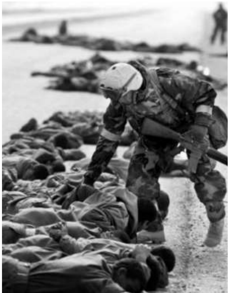
U.S. invasion of Iraq, March 2003.