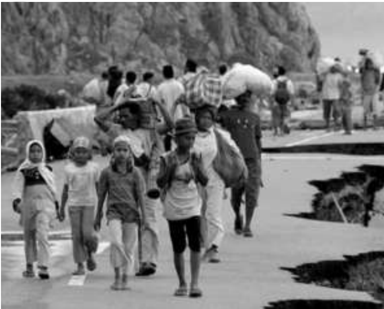
Refugees in Thailand after the 2004 Asian tsunami.

effects impacting export-oriented economies reliant on U.S. economic expansion.