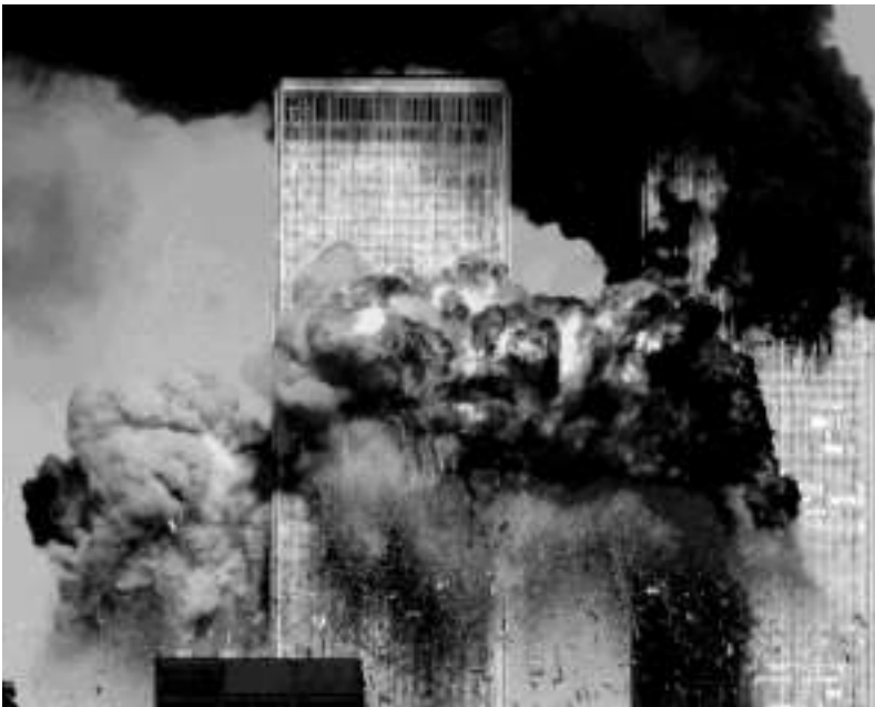
Sept. 11 attacks on the World Trade Center.