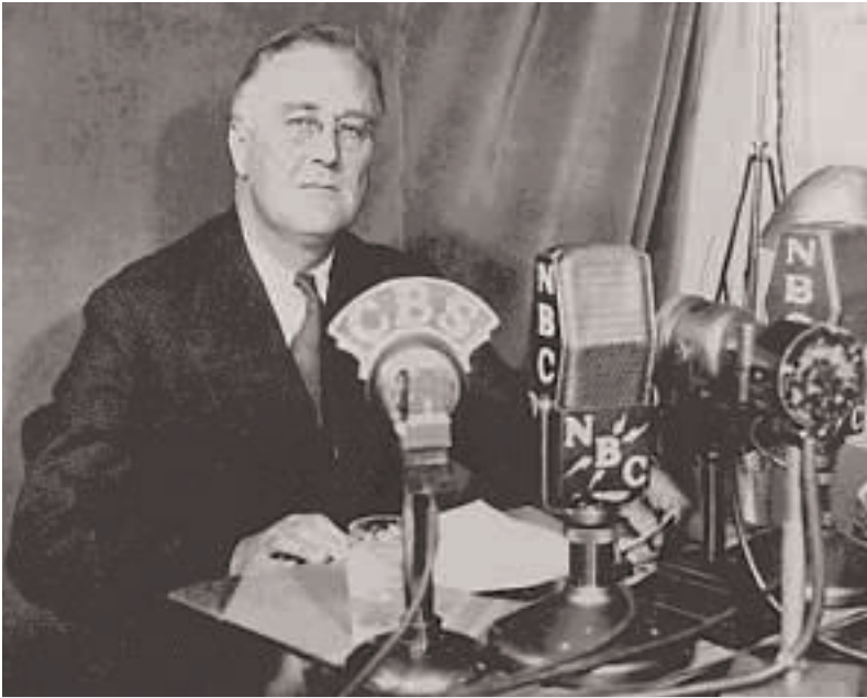
Franklin Delano Roosevelt during the broadcast of one of his fireside chats in 1935.

grams. However, others began casting about for a new bogeyman to justify a high military budget and to rally public support for U.S. military deployments in various parts of the world. The threat of “rogue states” became a common refrain.