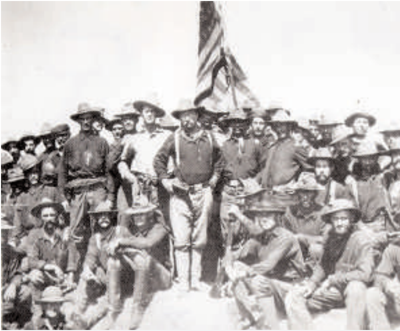
Colonel Teddy Roosevelt and his Rough Riders in Cuba during the Spanish-American War.

In his March 1933 inaugural address, Roosevelt announced a new approach to international relations that would become known as his Good Neighbor policy. “I would dedicate this nation to the policy of the good neighbor—the neighbor who resolutely respects himself and, because he does so, respects the rights of others.”